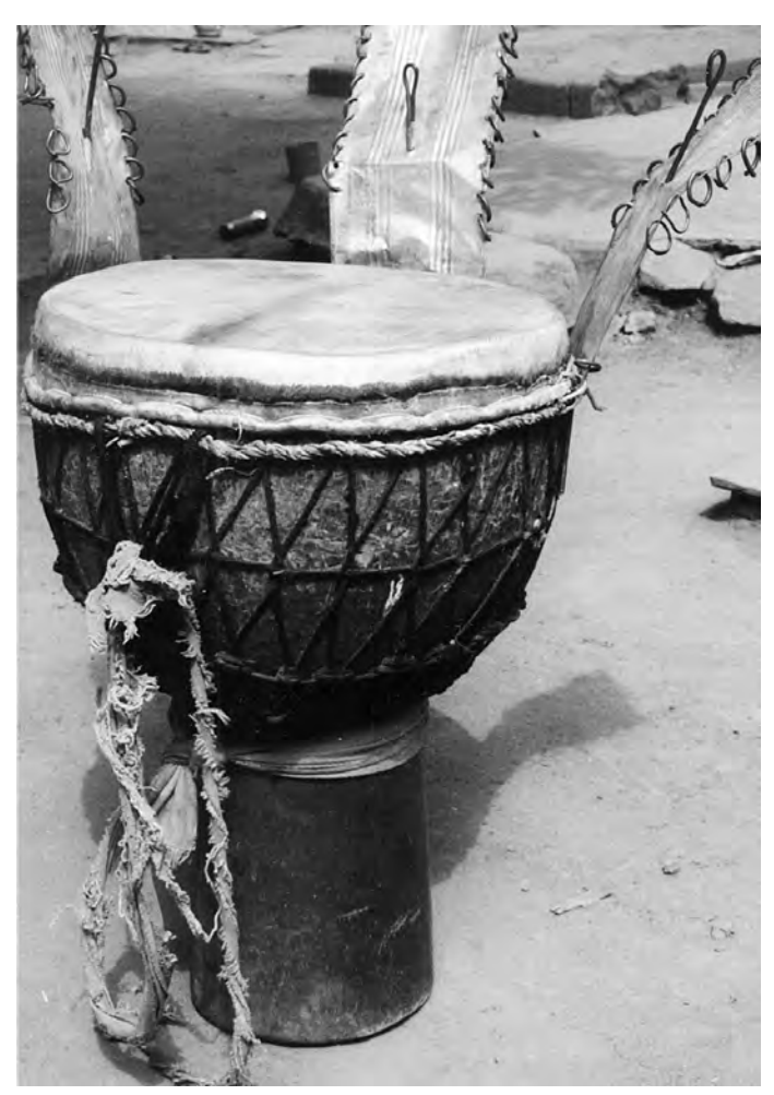
Fig. 5: Jenbe with sewn-on head. The tensioning cord is made of nylon; the sewing cord is of synthetic fiber too.

the older ones in the practice of urban professional drummers because of technical and economical advantages concerning the aspects of tensile strength, durability, and availability. Still, until the 1980s, the technique of sewing on the skin to one reinforcing and one tension-transmitting leather strap had not yet been subject to structural change as a result of using these new materials. The constituent parts were still assembled in the same way, and the components have continued to fulfill the same functions as before.