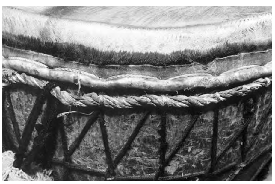
Fig. 6: Detail of the instrument shown in fig. 5. The tension transmitting strap running round the upper edge of the shell and the wedged in reinforcement strap (which can be seen as a bulge protruding in the edge of the skin) consists of several braids of leather cord.

the older ones in the practice of urban professional drummers because of technical and economical advantages concerning the aspects of tensile strength, durability, and availability. Still, until the 1980s, the technique of sewing on the skin to one reinforcing and one tension-transmitting leather strap had not yet been subject to structural change as a result of using these new materials. The constituent parts were still assembled in the same way, and the components have continued to fulfill the same functions as before.