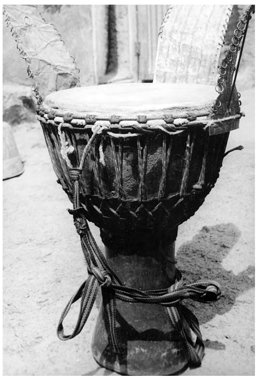
Fig. 7: A contemporary Bamako jenbe with rings made of 6-mm steel reinforcing bar (re-bar).

nique irrelevant of the materials used; these could be leather or leather mixed with wire and nylon cord. These are translations of the Bamana terms, nègè jenbe (iron jenbe) and nfòsòn jenbe (leather strap jenbe), and follows their indigenous usage.